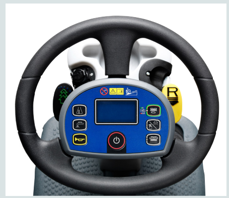
Easy to control: Extremely user friendly and easy to learn. Dashboard with One-Touch button and intuitive display integrated in the steering wheel