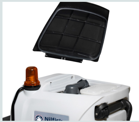
Easy to clean with recovery tank lid completely removable.