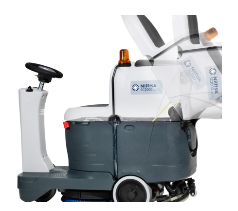
Recovery tank fully tiltable gives easy access to battery compartment and Ecoflex system