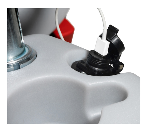
USB port as optional