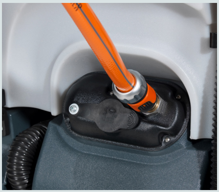
Filling system with automatic shut off when tank is full (optional)