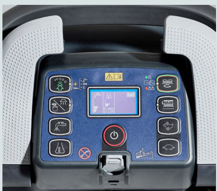
Informative digital display, intuitive icon buttons and new ergonomic drive paddle