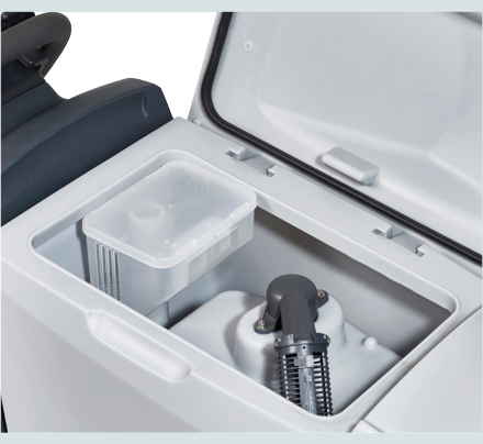
Productive: 45/45 liter water tanks and low energy consumption providing up to 5 hours of running time