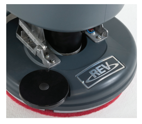
Optional SC500 REV<sup>™</sup> orbital scrubbing technology quickly and efficiently attacks dirt from multiple directions leaving the floor cleaner in a single pass