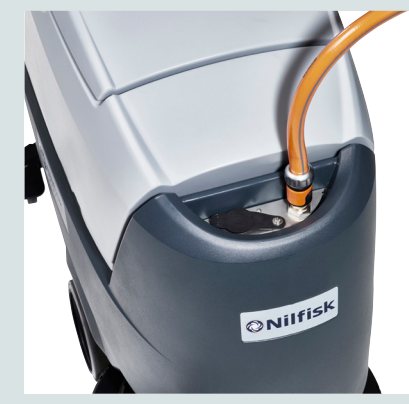
Water filling system with easy connection and automatic shut-off when tank is full (optional)