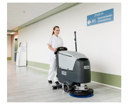
Ideal for daytime cleaning: Sound level reduced to just 60 \pm 3 dB(A) due to new low noise Vac motor system with silent mode setting