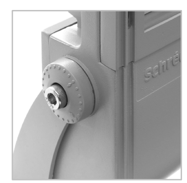
The universal U-bracket includes a graduation system for precise on-site settings.