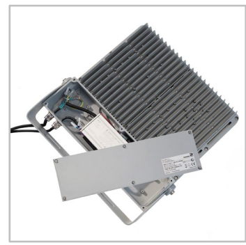
Easy integration with building management systems (DALI or 1-10V protocol).