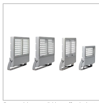
Four models are available to offer the best solution for all applications.