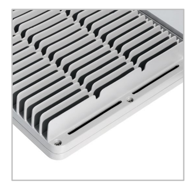
The cooling fins ensure a perfect thermal management, allowing the INDU FLOOD to operate in hot conditions.

The four models of the INDU FLOOD range make it perfect for various typical industrial lighting applications: loading bays, storage areas, security checkpoints, stairs, car and lorry parks, access roads and paths. The INDU FLOOD luminaires can be used indoor and outdoor, with direct or indirect lighting. They can be controlled via a DALI or 1-10V interface.